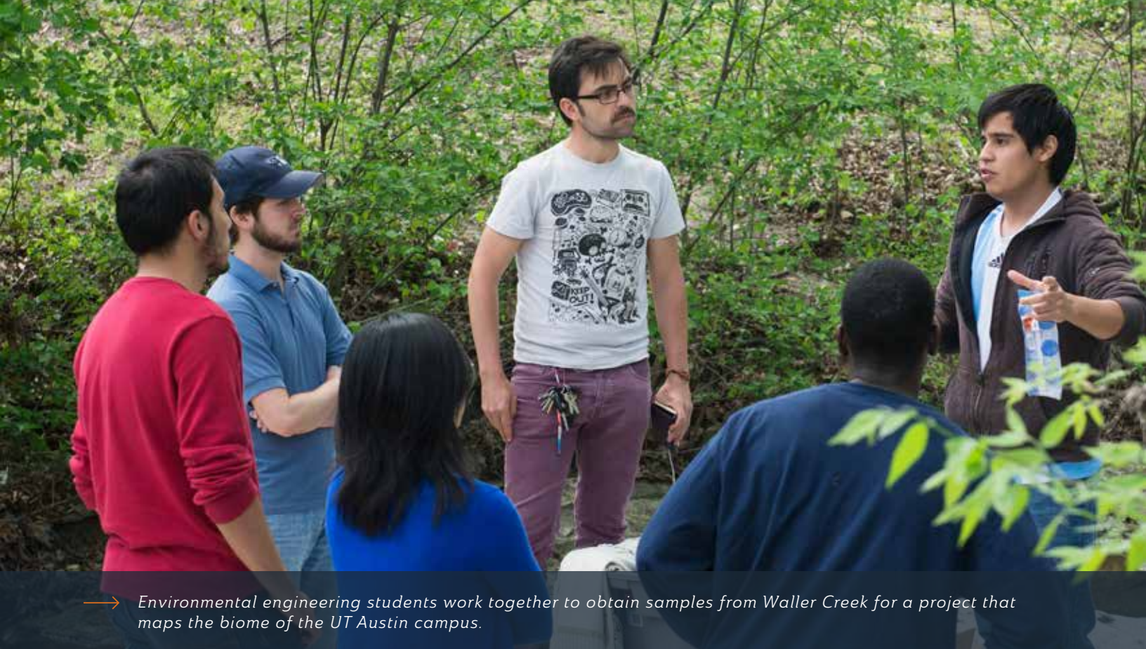
→ Environmental engineering students work together to obtain samples from Waller Creek for a project that maps the biome of the UT Austin campus.